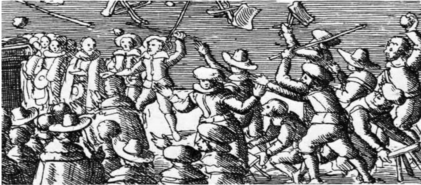
Enclosure of the commons (Britain, 1500s)