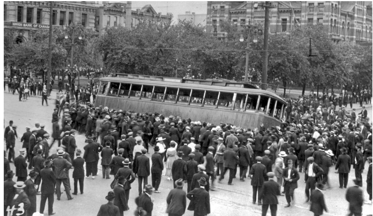
Winnipeg General Strike, 1919