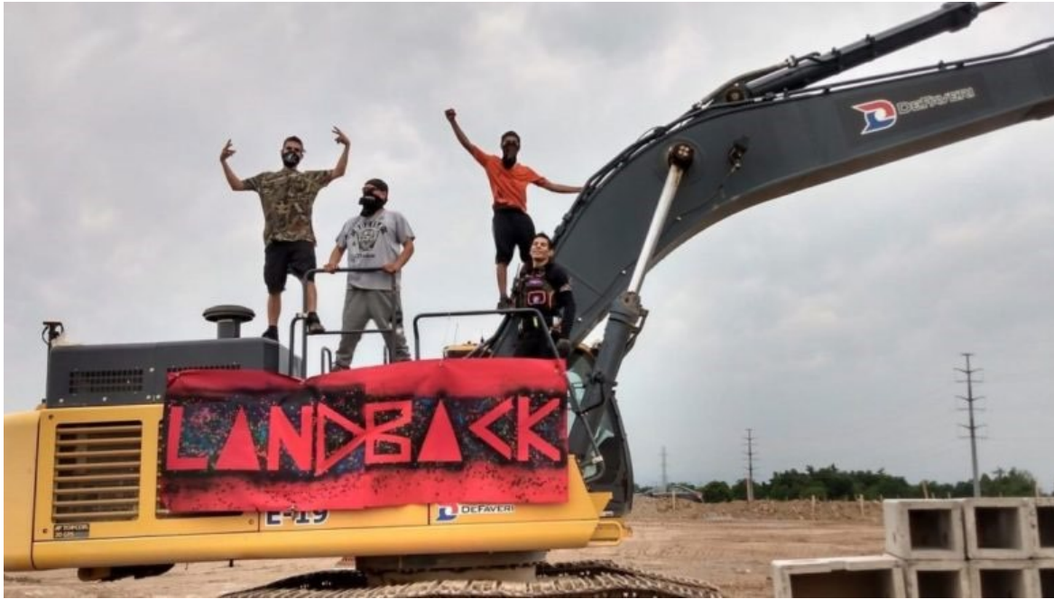
1492 Land Back Lane. Haudenosaunee face off against Foxgate Development (North Shore, 2020)