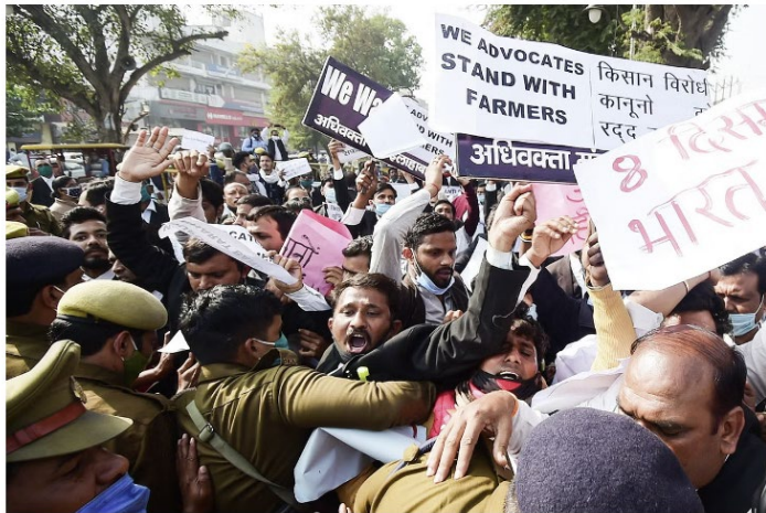
Protesters scuffle with police during a rally in support of the nationwide general strike called by farmers against the recent agricultural reforms in Allahabad, India, on Tuesday.