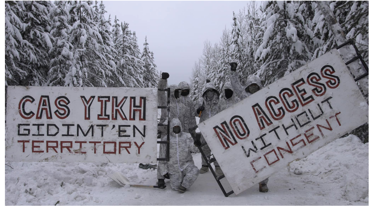
Wet'suwet'em face off against Coastal Gaslink.