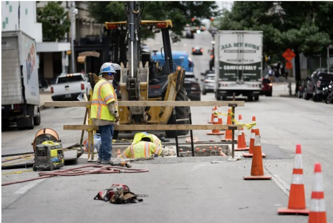
Construction laborers work in downtown Austin on June 29, 2021.