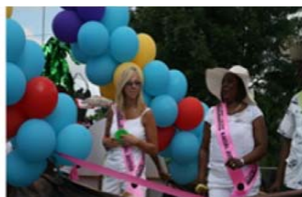
First Nations Day of Protest march